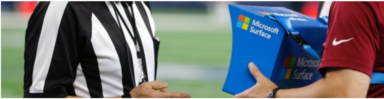
Walt Anderson , The Canadian Press

Officials and coaches worried about their health and safety amid the COVID-19 pandemic will soon have a revamped tool of their trade available for use in their return to play protocols: the 'whistle mask.'